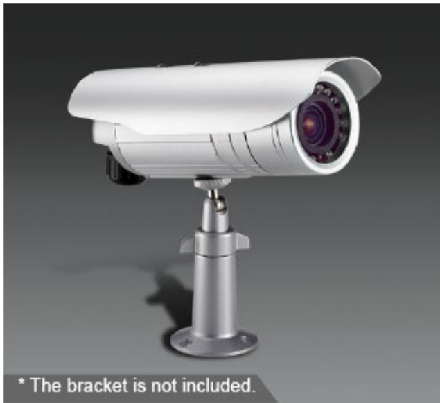
* The bracket is not included.